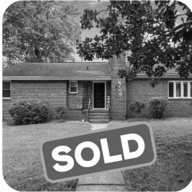
219 W. McGinnis Sold: $299,500