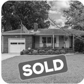
335 E. McGinnis Sold: $305,000