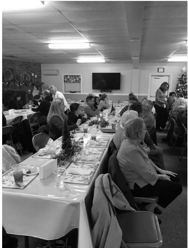
It's always a good time when neighbors get together

More merriment photos from the civic league Christmas party!