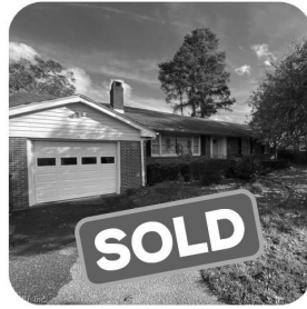
248 E. McGinnis Sold: 325,000