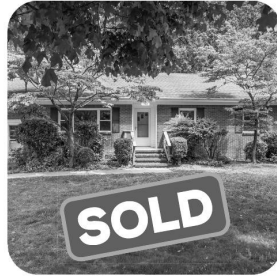
240 E. McGinnis Sold: $347,000