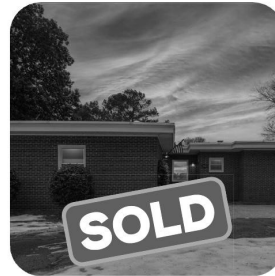
337 W. McGinnis Sold: $350,000