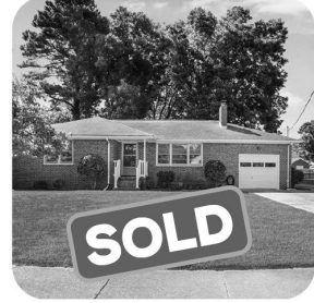
321 E. McGinnis Sold: $320,000