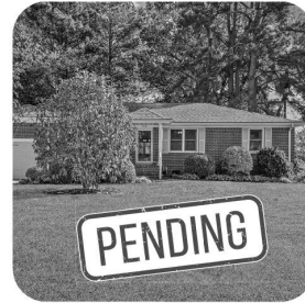
231 E. McGinnis Listed: $450,000