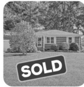
236 E. McGinnis Listed: $460,000