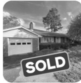
248 E. McGinnis Sold: 325,000