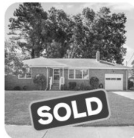
321 E. McGinnis Sold: $320,000