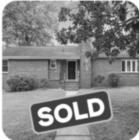
219 W. McGinnis Sold: $299,500

Check out our 2023/2024 sales in River Forest Shores: