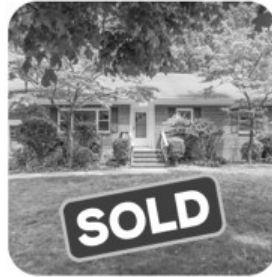
240 E. McGinnis Sold: $347,000