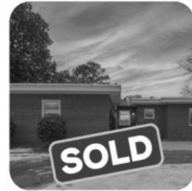
337 W. McGinnis Sold: $350,000