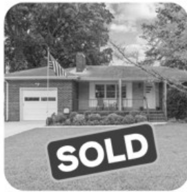
335 E. McGinnis Sold: $305,000