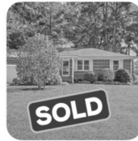
236 E. McGinnis Listed: $460,000